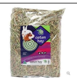
Friendly Earth Oaten Hay