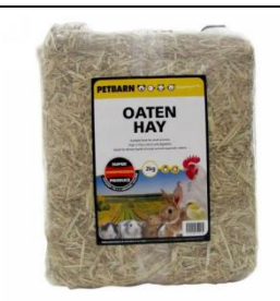
Petbarn Oaten Hay